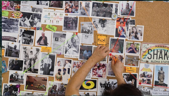
Connecting the dots of the Shaka story.